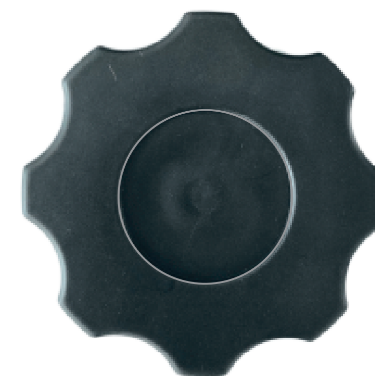
Adjustable Knob for 360 rotating and height adjusting