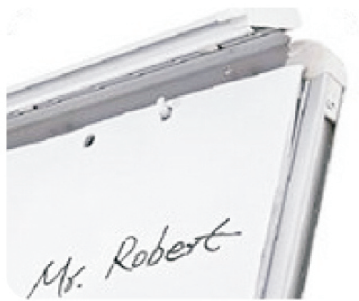
Aluminum clamp and Flipchart hooks